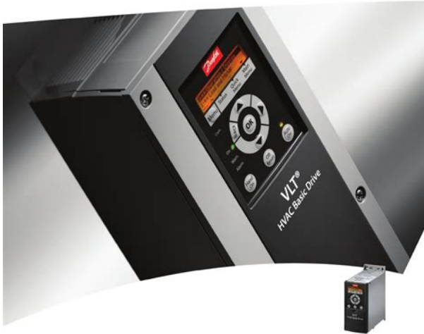
Design Guide VLT® HVAC Basic Drive FC 101